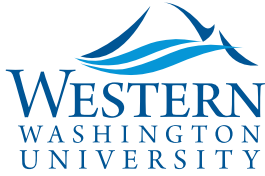
Figure B6: Western Washington University

Students receive the following email message, scheduled through a nightly job triggered by their initial loan award offer: